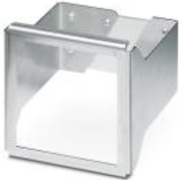
DIN rail adapter for EEM-MA600 and EEM-MA400 energy meters

Please be informed that the data shown in this PDF Document is generated from our Online Catalog. Please find the complete data in the user's documentation. Our General Terms of Use for Downloads are valid ( http://phoenixcontact.com/download )