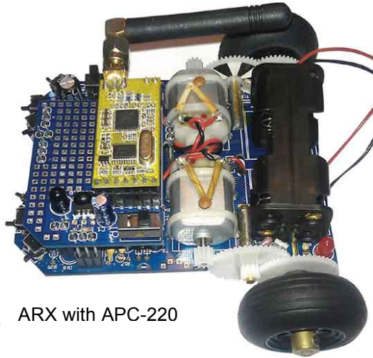
ARX with APC-220