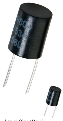
Actual Size (Max.)