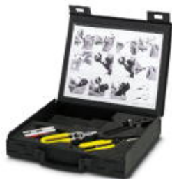
Tool set for PCF assembly, for 200/230 \mu\text{m} , 50/200/230 \mu\text{m} , and 62.5/200/230 \mu\text{m} PCF fibers

Please be informed that the data shown in this PDF Document is generated from our Online Catalog. Please find the complete data in the user's documentation. Our General Terms of Use for Downloads are valid ( http://phoenixcontact.com/download )