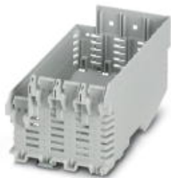
Component housing, length: 120.6 mm, Lower part, color: light gray, width: 75.9 mm, height: 57.7 mm

Please be informed that the data shown in this PDF Document is generated from our Online Catalog. Please find the complete data in the user's documentation. Our General Terms of Use for Downloads are valid ( http://phoenixcontact.com/download )